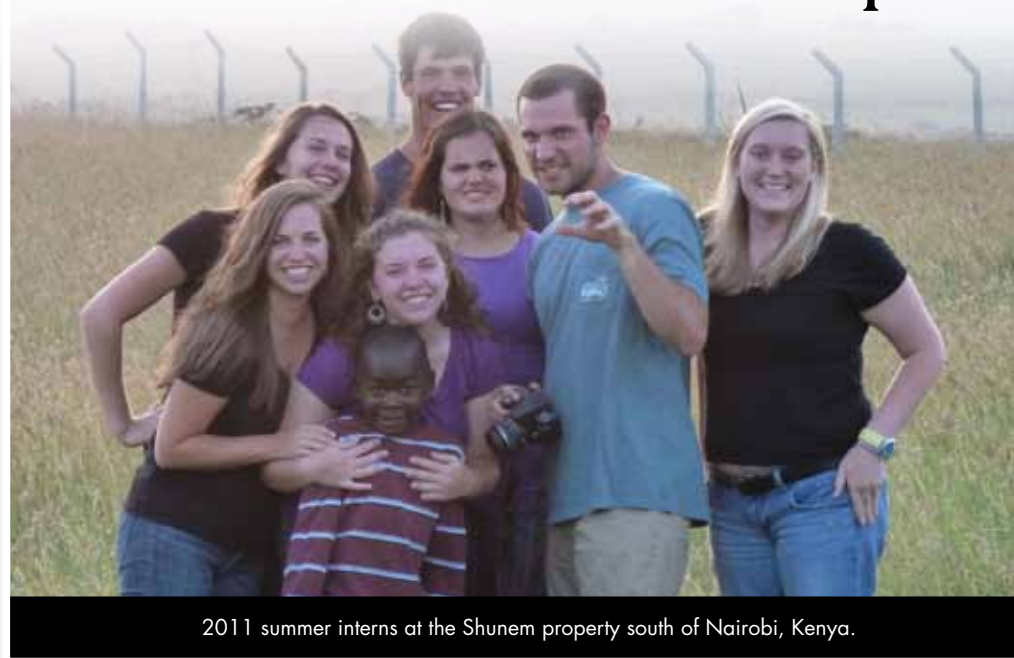
2011 summer interns at the Shunem property south of Nairobi, Kenya.