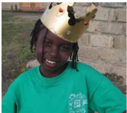
The children received cool green “Kids Camp” t-shirts.