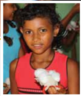
Oneida with a craft creation.