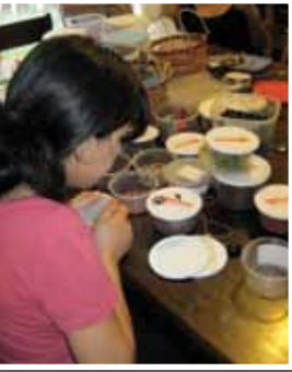
Crafting beautiful creations at the House of Glory